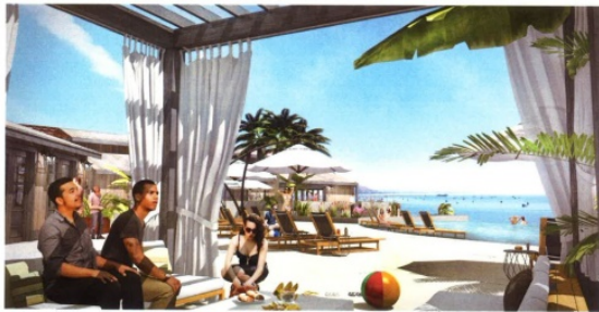
rrm design group PERSPECTIVE SKETCH OF THE POOL DECK (COMMERCIAL AREA) HARBOR TERRACE DATE: November 2, 2017 PROJECT: A10

Harbor Terrace Development Moves Forward - On January 31 st , the Board of Commissioners adopted Resolution 18-02, by a 5-0 vote, which approved a 50 Year Ground Lease with RTA Harbor Terrace, LLC. RTA plans to break ground in spring/summer of 2019 and, when completed, the site will feature 57 RV pads/sites, 53 walk-in and drive-in tent camping sites and a variety of 51 RV Cabins.