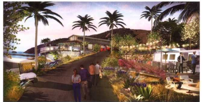
rrm design group ARRIVAL PERSPECTIVE SKETCH HARBOR TERRACE DATE: November 2, 2017 PROJECT: A3

A lodge, swimming pool, restaurant/café, recreation facilities and other visitor amenities will also be included in the development. The existing uses, including the Fishermen's Gear Storage, Trailer Boat Storage and Harbor Use Area, will remain on the site and continue to be used in the operations of the Port.